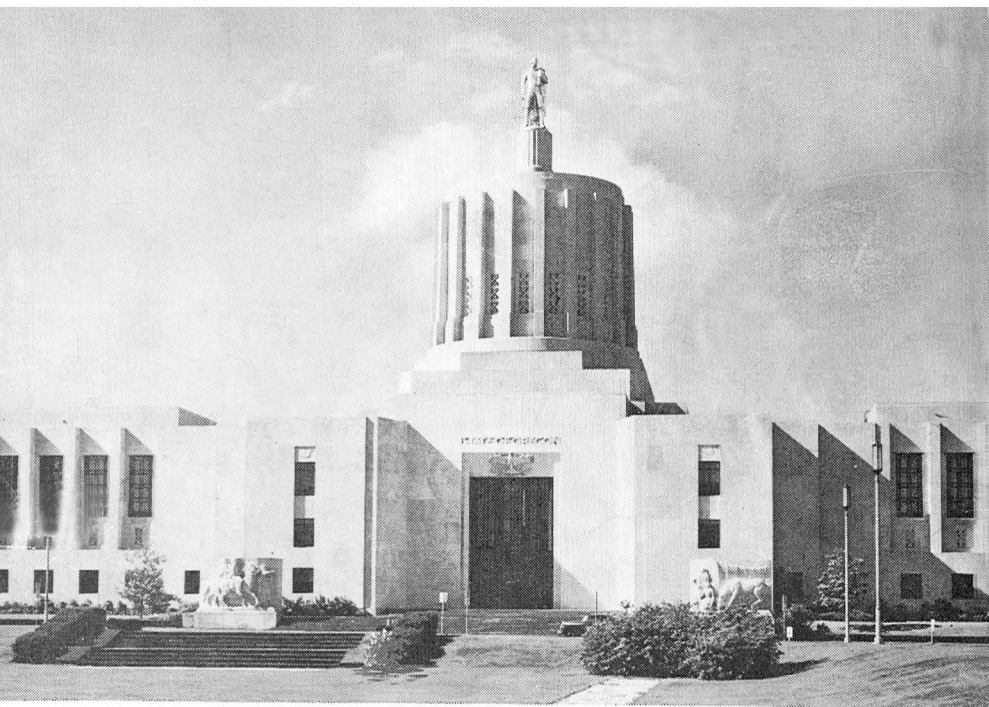
OREGON STATE CAPITOL